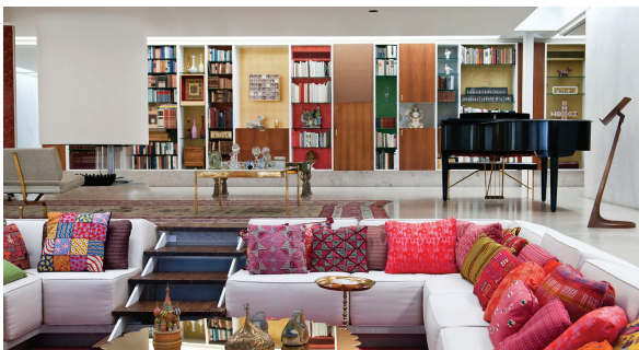
Miller House (Eero Saarinen, 1953)