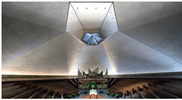
North Christian Church (Eero Saarinen, 1964)