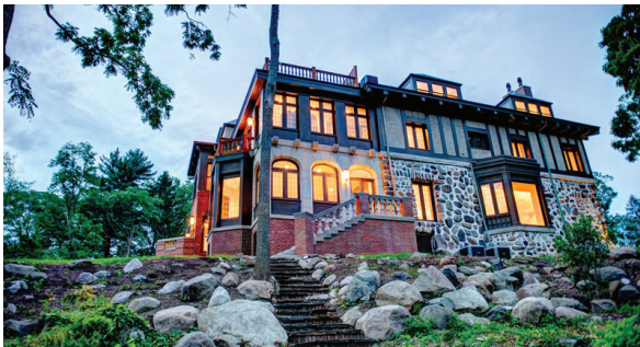
Parry Mansion (1904)