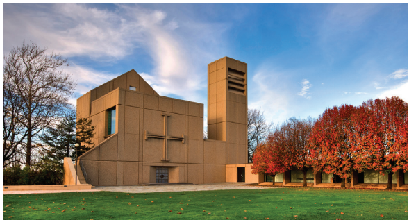
Christian Theological Seminary (Edward Larrabee Barnes, 1966)